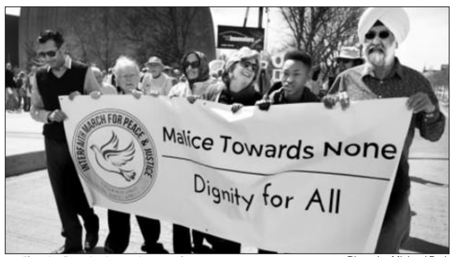
Our "front line" in Columbus made a great first impression.

Our banner, by contrast, we had to pay for, since it was printed at Staples. This we were able to do because of generous donations from some individual donors. (We made a point of thanking all such contributors at the beginning of our program. Their contributions were indispensable).