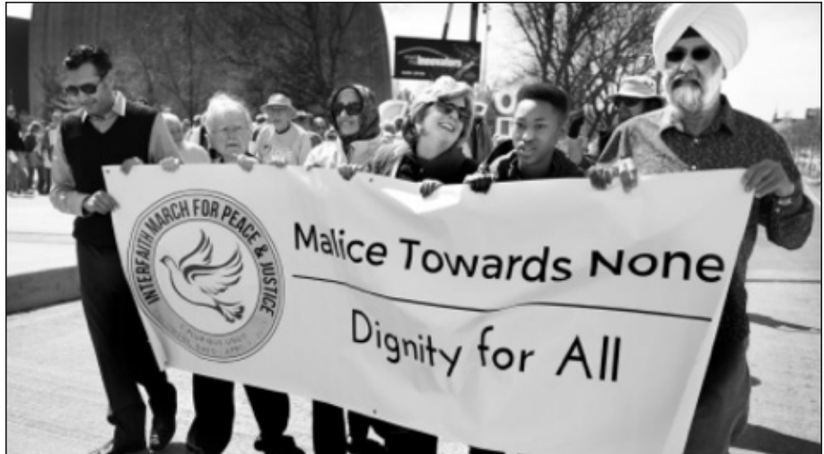
Our "front line" in Columbus made a great first impression.

Our banner, by contrast, we had to pay for, since it was printed at Staples. This we were able to do because of generous donations from some individual donors. (We made a point of thanking all such contributors at the beginning of our program. Their contributions were indispensable).