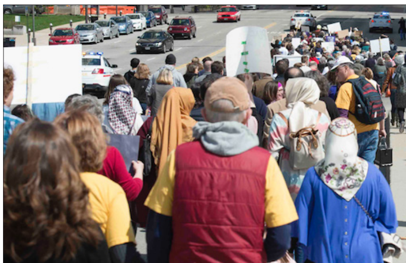
The 2017 Columbus event with full police escort. Our marchers, five abreast, covered a full city block.

Please remember that the ignorance of people whose minds have been poisoned by racism and prejudice is never more evident than when it is directed against the innocent and the peaceful. Tempting as it may be to engage in a shouting match with vicious, mean-spirited hecklers, we hope that all of those representing the Interfaith March for Peace & Justice will “go high” and not be baited. Such a confrontation, handled peacefully by us becomes a golden opportunity to put our message of peace on display and throw the bigotry of our opponents into stark relief. For your restraint in this regard, and for your efforts in every other facet of planning and carrying out this march, thank you! And best of luck for a successful event!